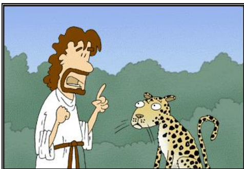
"Lepers...I heal lepers."