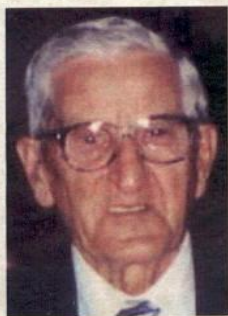
Born October 27, 1920 Died December 1, 2008