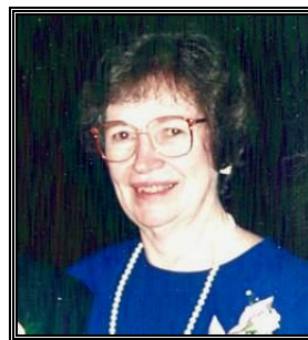
In Loving Memory of